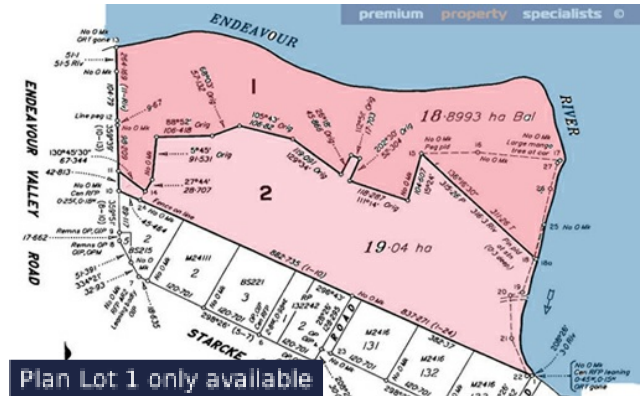
Plan Lot 1 only available