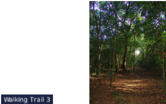
Walking Trail 3