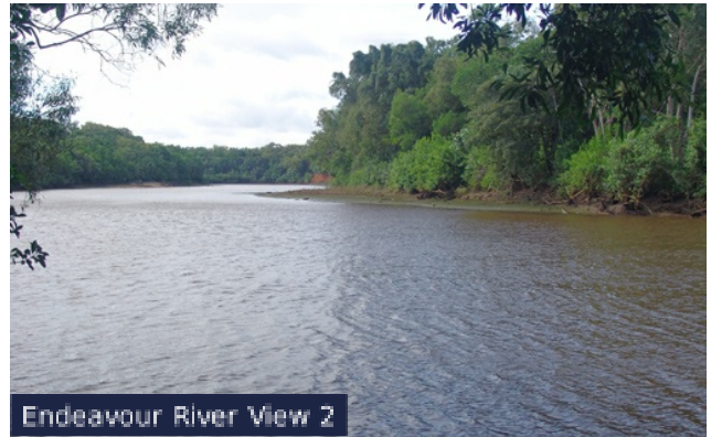
Endeavour River View 2